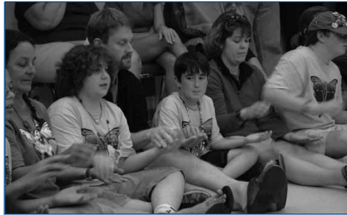
Camp Nabi participants and volunteers enjoy an experience with sound together.

Both programs are designed to let campers know that the feelings they're experiencing regarding their personal loss are normal and that they aren't alone in their grief. The young people also learn that healing is a journey and a period of growth. Through various reflective activities, the youth experience emotions, face challenges and transform their own confusion and sadness into accomplishments and personal triumphs. All of this coincides in the midst of making new friends and having fun with their peers.