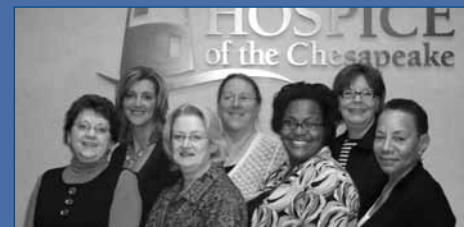
Hospice of the Chesapeake's team for the Breast Cancer 3-Day Walk.