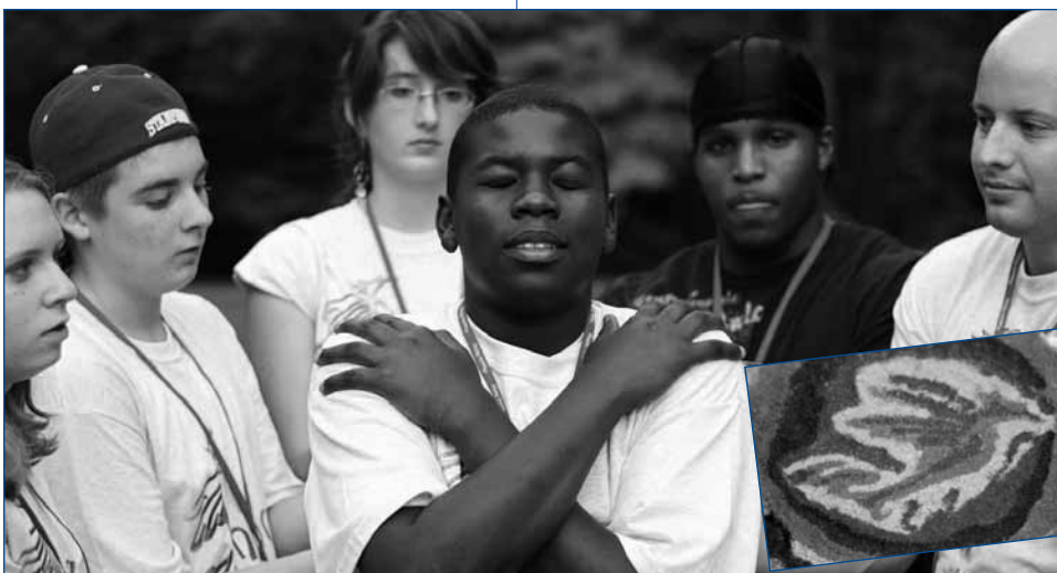
2007 Phoenix Rising teens participate in a trust circle group activity. Also pictured is a sand mandala of the Phoenix symbol.