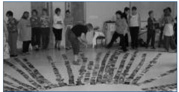
Soul Collage® training participants observe their final product – a collection of personal photos used during the grieving process.

During SoulCollage® participants create a deck of collaged cards from "found" images, taken from magazines, calendars, books, or personal photos. Individuals can make collages on their own or within a group setting. Within a group, collages are discussed and explored using role-playing and supportive feedback. The individual creating the collage develops a powerful visual and written record of their life journey.