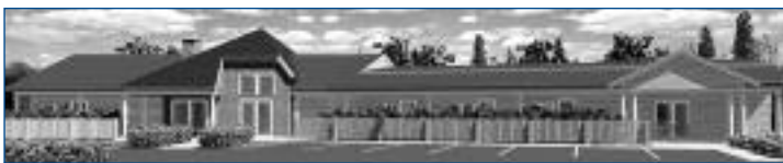
Architectural rendering of the finished wing of the Betty Jane & Creston G. Tate Foundation Chesapeake Hospice House.