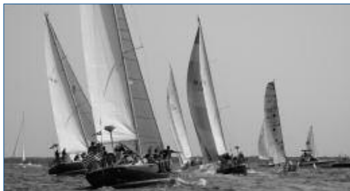
Sailors enjoy a day on the Chesapeake Bay during the 26th annual Hospice Cup Regatta.

I n September 2007, Hospice of the Chesapeake held two of its signature events – the annual Golf Tournament and the Hospice Cup XXVI Regatta. This year's 5th Annual Golf Tournament drew 124 players and was supported by 20 Hospice of the Chesapeake volunteers and staff members. The golf tournament raised $80,000 in gifts and in-kind donations. Hospice of the Chesapeake thanks the golf tournament's major sponsors: Bausum & Duckett Electric Co., Inc., the Stephen & Renee Biscotti Foundation, Comcast, Greenberg Gibbons Commercial Corporation, Jermaine E. Lewis Foundation, M.D. News, Provident Bank and Reliable Contracting Co., Inc.