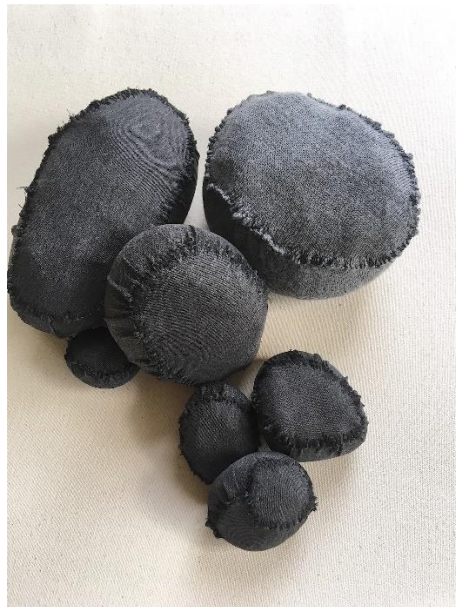
Sculpture by c. l. bigelow