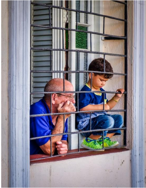
from his February 2018 trip to Cuba