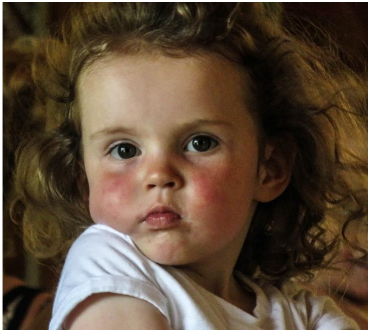
"Girl," photography by Wil Scott